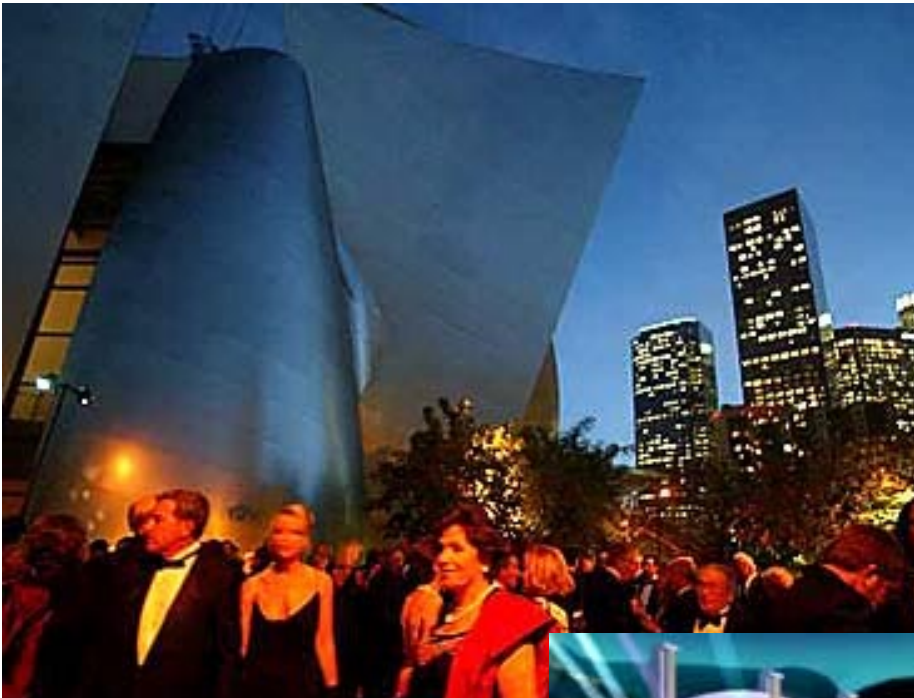
Photos, Counter Clockwise from UL: Disney Hall exterior; Orpheum Theatre, Zipper Concert Hall Center: New Hollywood Bowl