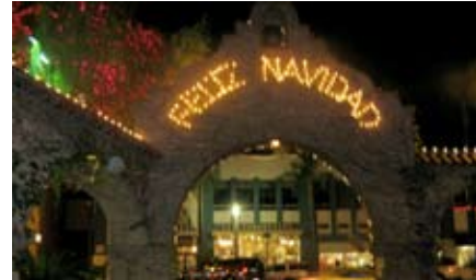
Seasons Greetings at the Mission Inn