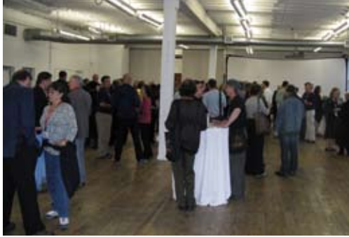
Conference attendees enjoying CP's hospitality