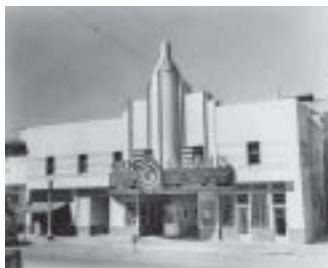
The Grand in 1941

In 2002, the City of Tracy purchased the Grand Theatre and the adjoining properties and hired the architectural firm of ELS Architecture and Urban Design of Berkeley, Calif. to develop a renovation design for the new arts center. McFadden Construction Inc. of Stockton was awarded a $12.2 million contract to build the center and broke ground in June of 2005.