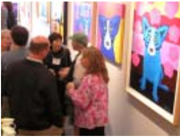
Opening Night Reception at the Blue Dog Gallery